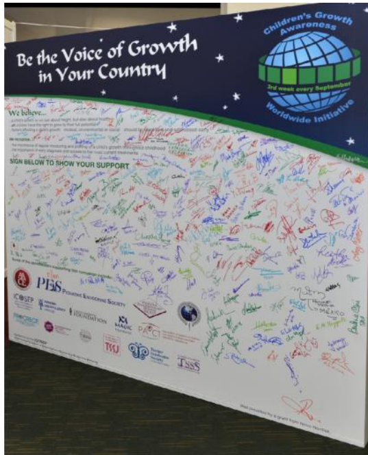
Exhibit at the European Society of Pediatric Endocrinology